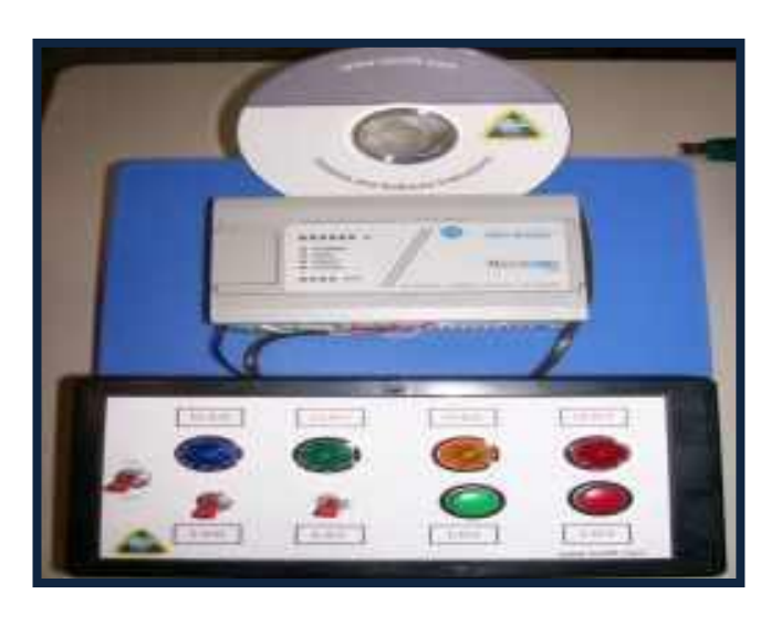
Allen Bradley Micrologix 1000 Simulator (Digital)

Practical sessions will be organized during the course for delegates to practice the theory learnt. Delegates will be provided with an opportunity to carryout various exercises using one of our state-of-the-art simulators "AB Micrologix 1000 (Digital)" and "Logix Pro 500".