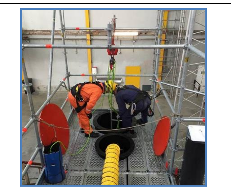
Rope Rescue Operations

Practical sessions will be organized for delegates to practice the theory learnt. Delegates will be provided with an opportunity to carryout rope rescue operations using Haward equipment. Theory learned in the class will be applied using the rope rescue methods and equipment.