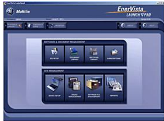
GE Multilin Relay 469 Simulator