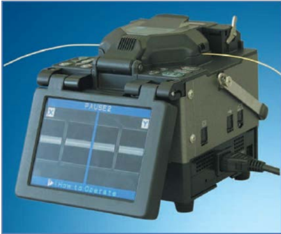
FSM-50S PROFILE ALIGNMENT FUSION SPLICER

Practical sessions will be organized during the course for delegates to practice the theory learnt. Delegates will be provided with an opportunity to carryout fiber optic splicing, testing and troubleshooting exercises using the following state-of-the-art fiber optics technology and equipment, suitable for classroom training.