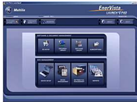
GE Multilin Relay 469 Simulator