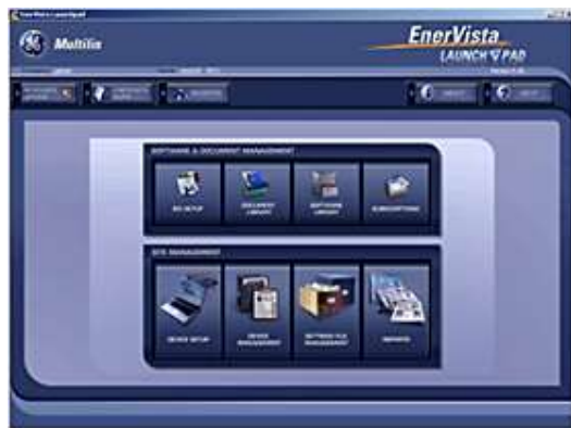
GE Multilin Relay 750 Simulator